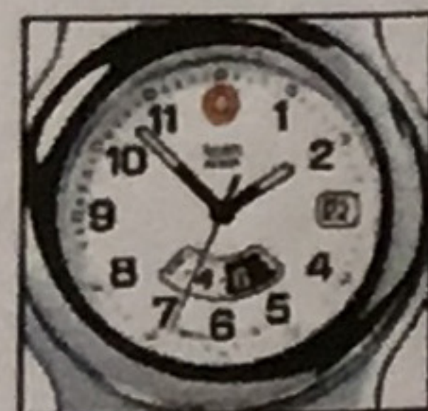
Rio de Janeiro